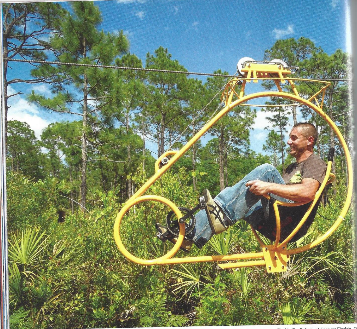
Florida EcoSafaris at Forever Florida, St. Cloud