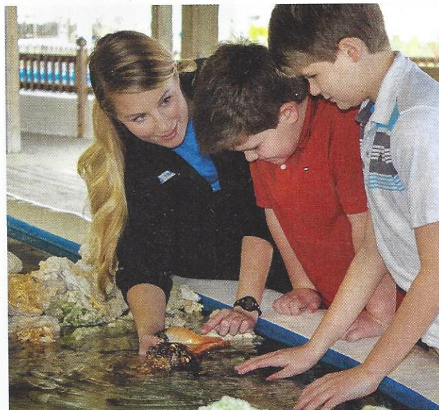
Gulfarium Marine Adventure Park, Fort Walton Beach

Tampa's historic cinema recently went digital, but it still maintains